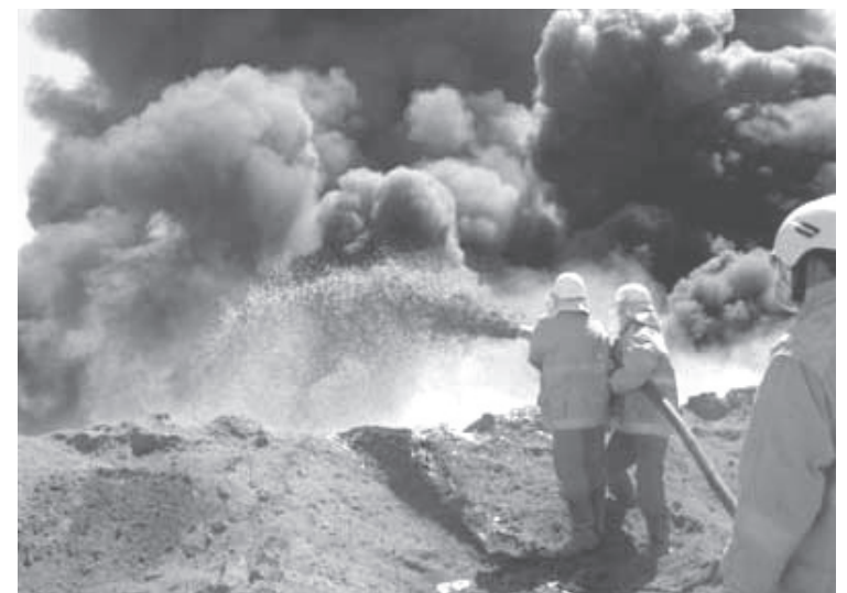
IRAQI INSURGENTS: Iraqi insurgents sabotage a major gas pipe line in Northern Iraq.

for Victory in Iraq. In this address, the plan for transition of government and solidification of democracy were described in detail. Bush rejected a formal timetable for American withdrawal, and said that leaving Iraq now would throw the country into chaos and pandemonium. In this