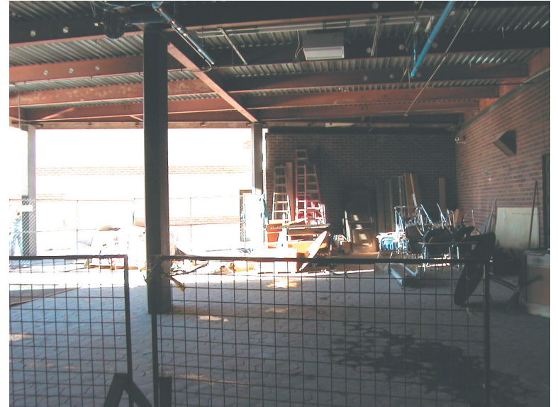
CONSTRUCTION: Shot off of patio B, construction seems to be lagging.

will be ready for use by September 2006. For the time being, the band and choir rooms have been moved to small rooms or trailers, and a makeshift stage in the Commons is used for Alchemist productions and various ceremonies. If voters voted against the referendum, construction would have come to a halt and many new spaces would not be available, including: 19 new classrooms, 4 science labs, 2 large lecture halls, an instrumental music room, choir room, auditorium, music, photo and computer labs, a greenhouse, and a broadcast studio. "If the referendum is defeated, the Board of Education may be faced with shut-