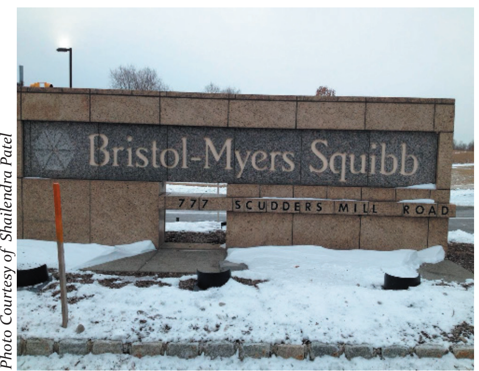
The sign outside of a Bristol-Myers Squibb building.

With such a high level of effectiveness, many people are wondering what is it that makes the drug so effective in cancer patients. The answer lies in the drug's ability to expose cancer cells, like those in tumors, before they can become lethal. Cancer cells, most of the time, disguise themselves using a key mechanism called PD-1. This mechanism allows the cancer cells to avoid detection by the immune system. Opdivo contains an antibody that binds to that mechanism and blocks PD-