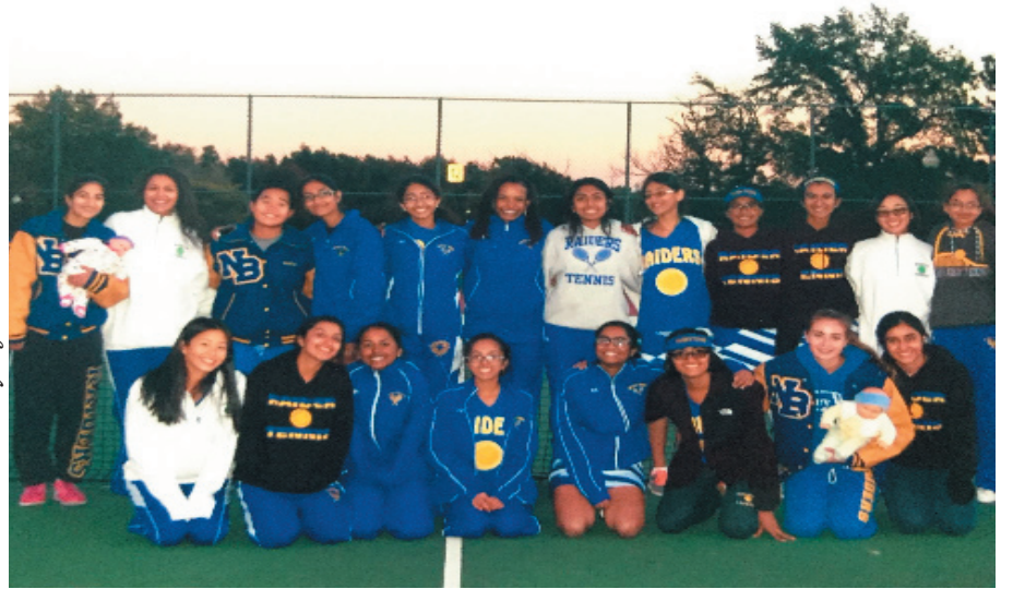
The girls tennis team had a successful season and celebrated on senior night.