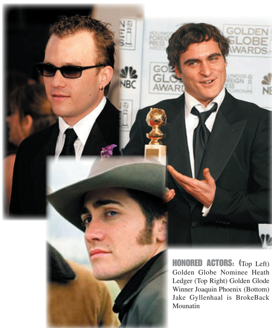
HONORED ACTORS: (Top Left) Golden Globe Nominee Heath Ledger (Top Right) Golden Globe Winner Joaquin Phoenix (Bottom) Jake Gyllenhaal is Brokeback Mountain

On Monday, January 16, the 63rd Golden Globe Awards ceremony took place. It was a triumphant night for homosexual and transsexual films such as "Brokeback Mountain" , the leading winner with four Golden Globes, "Capote" , and "Transamerica" .