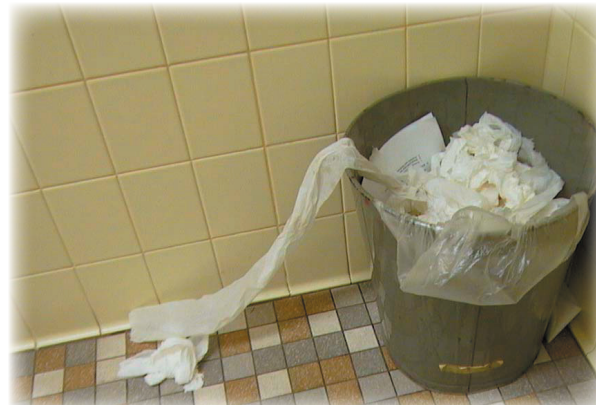
GARBAGE: The garbage in the upstairs girl's bathroom

perpetrate the dastardly accomplishments must have a certain goal in mind. Although the reasoning behind the impulse to rip a soap container off the wall and spread its contents on the floor seems just beyond my level of comprehension, I resign myself to