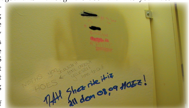
GRAFFITI: Colorful choice words from NBTHS students

the following comments: "Congratulations! You have proven your strength and maturity by kicking in the door to an aluminum stall. You have now made it impossible to have a moment's privacy without the fear of a boot crashing through the door and into your face.