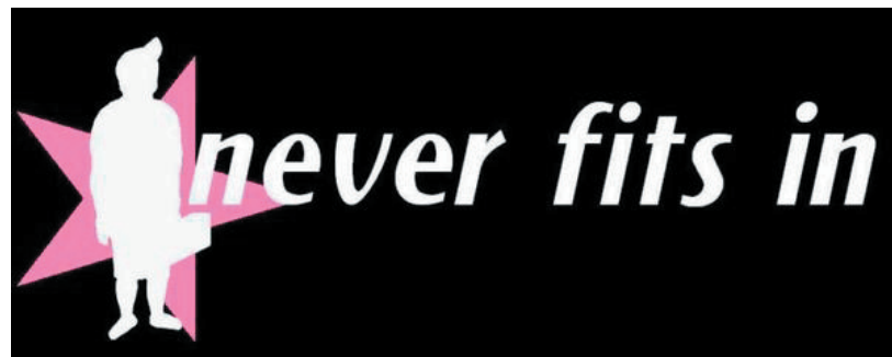
WINNERS OF THE 2006 BATTLE OF THE BANDS