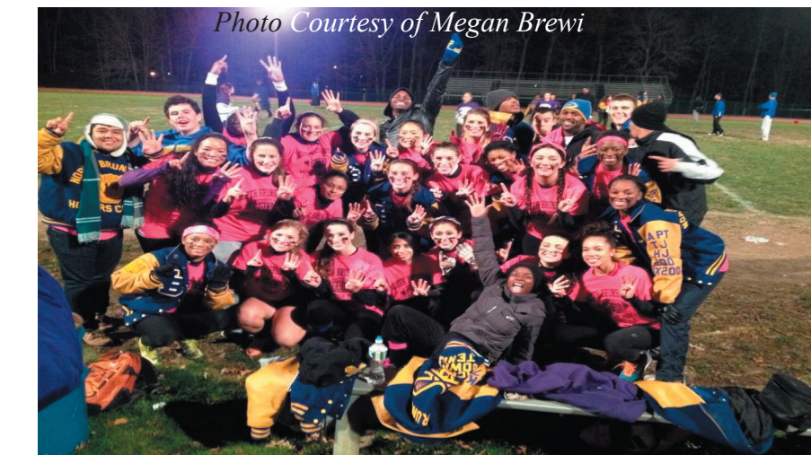
POWDER PUFF CHAMPIONS, THE SENIORS, POSE FOR A PICTURE AFTER THE BIG GAME.

The hard work and dedication from the senior girls however, clearly paid off as they went on to win first place! As this is their last year, the senior girls have