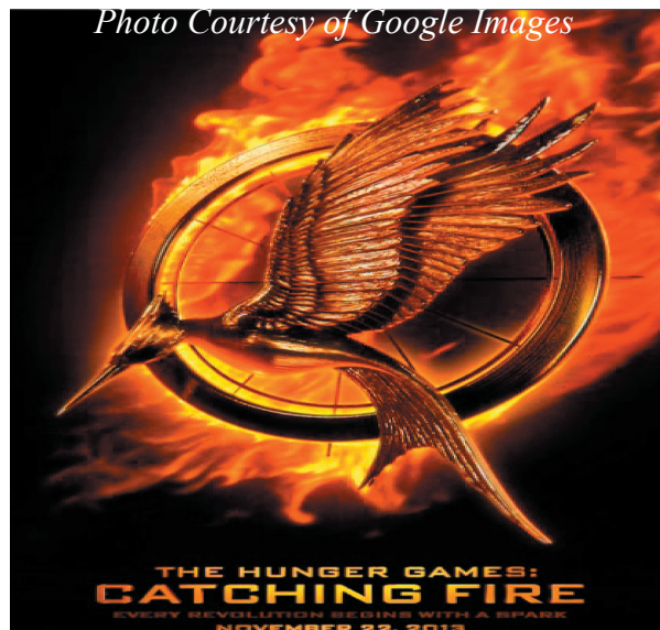
CATCHING FIRE HAS BECOME A WORLDWIDE SENSATION FOR ALL AGES

expertise of the director, Francis Lawrence. He did not direct the first film, The Hunger Games, and we shall see if he can do the book as much justice as Gary Ross